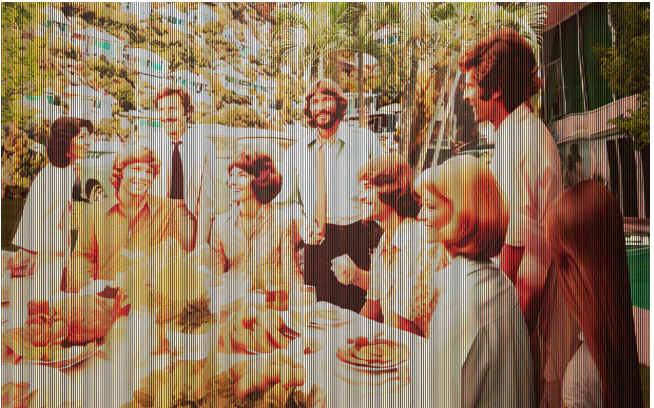
One of several Augmented Reality views in Optimism

A speculative colony also features on a special edition cover of the latest issue of magazine Art News New Zealand .