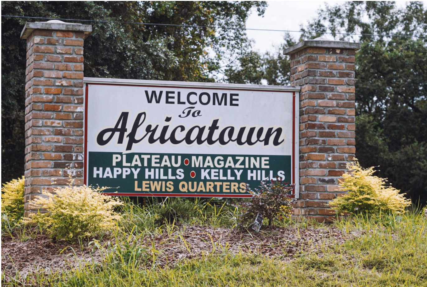
Welcome to Africatown image by CG Foisy. Image above Atquezali Quiroz with Kalpulli Yaocenxtli dances at a Stop Line 3 Rally by Jaida Grey Eagle