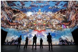
"Heaven's Gate," by Marco Brambilla, will be shown at Outernet from January 22. Outernet